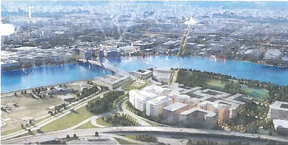
Figure 2 View of proposed PUD looking northwest, toward the US Capitol Building